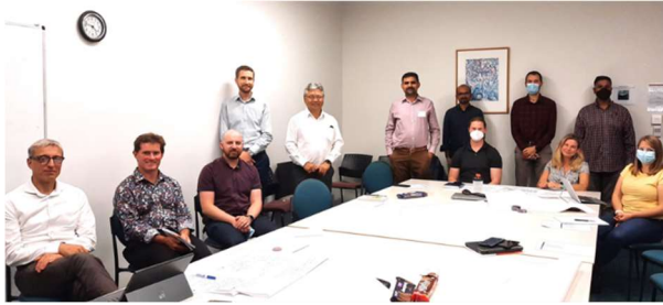
At the workshop with Council staff

During collaborative workshops, the driving force behind this amalgamation of minds was to gain a comprehensive understanding of what the council could achieve concerning sustainability and its long-term implications.